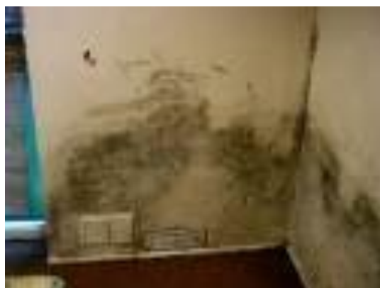
Condensation 'Black Spot' ( Aspergillus Niger )

The filters on a Vericure Flat will prevent dust, pollen, insulation fibres and other floating pollutants from entering the home. Vericure Flat has over twice the filter area of any competitor. This was arrived at following 20 years experience. In addition, only the Vericure filter uses the high efficiency G3 filter material, fine enough to take out pollen. Replacement filters can be purchased from Vericure.