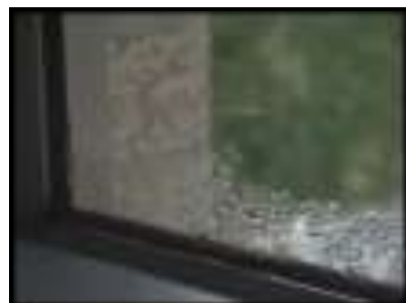
Condensation on windows